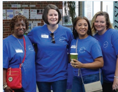
Sentara Medical Group