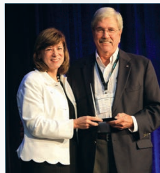
E n4a Excellence in Leadership Award