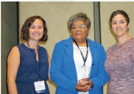
D Seniors Corp Award