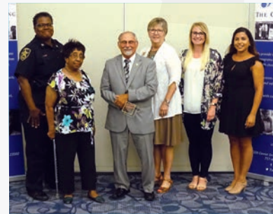
Comfort Calls Volunteers

6 Volunteer events were held in Fiscal Year 2018, with a total of 134 individuals serving the organization as volunteers.