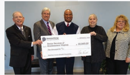
Dominion Energy Grant

$6,000 I-Ride from the Franklin-Southampton Area United Way