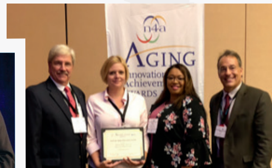
C Aging Achievement Award