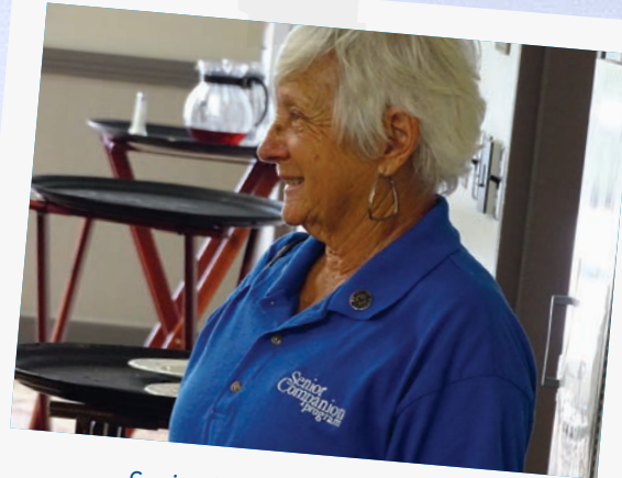
Senior Companion Recognition

86 seniors received 7,753 hours of care through the Personal Care Program.