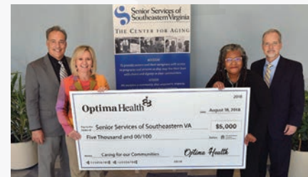
Optima Health Grant

$25,000 Planning Grant/No Wrong Door Connectivity Project from the Hampton Roads Community Foundation