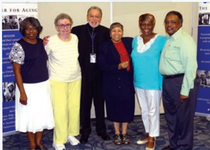
Senior Advocate Ombudsmen