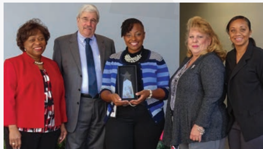
A HQI Presentation