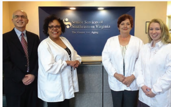
Care Transitions Intervention®

61 clients were helped through the Care Coordination program.