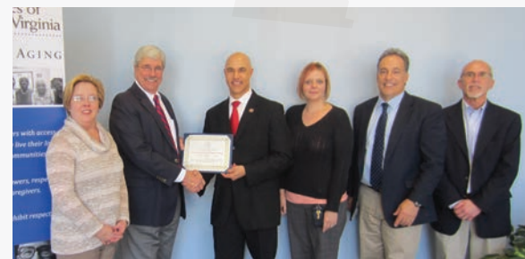
B V3 Certification Award