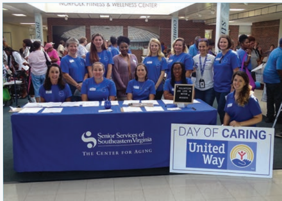
Sentara Medical Group

All that SSSEVA accomplishes each year would be impossible without help from our volunteers. Our supporters spend tireless hours in our offices, in the communities we serve, and through supporting our staff at agency special events. Here's a look into all our volunteers do to make SSSEVA all that we are to the seniors and caregivers we serve.