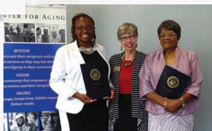
G Letters from Senator Warner