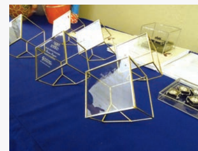
F 2018 Volunteer Recognition